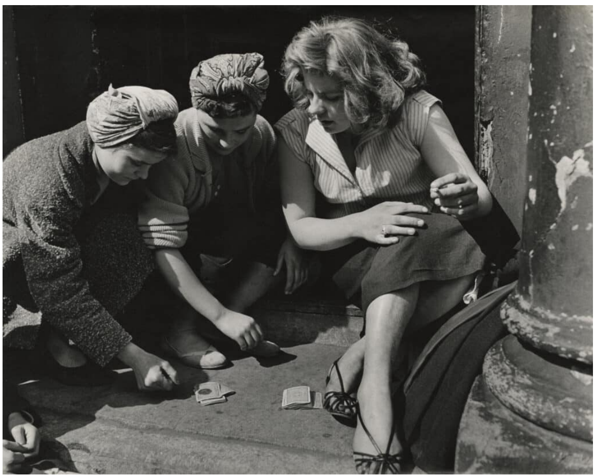
Girls Gambling, Southam Street, North Kensington, London, 1956.

It's a world that is nostalgic in some ways, but is also a reminder of what we have lost. The public sites Mayne photographed, the spaces of the street, have been taken over by cars or commodified and securitized. And when we wonder at the nostalgia of it all, it might be a nostalgia tinged with mourning, not at what we have lost in our striving for affluence but at what has been taken from us.