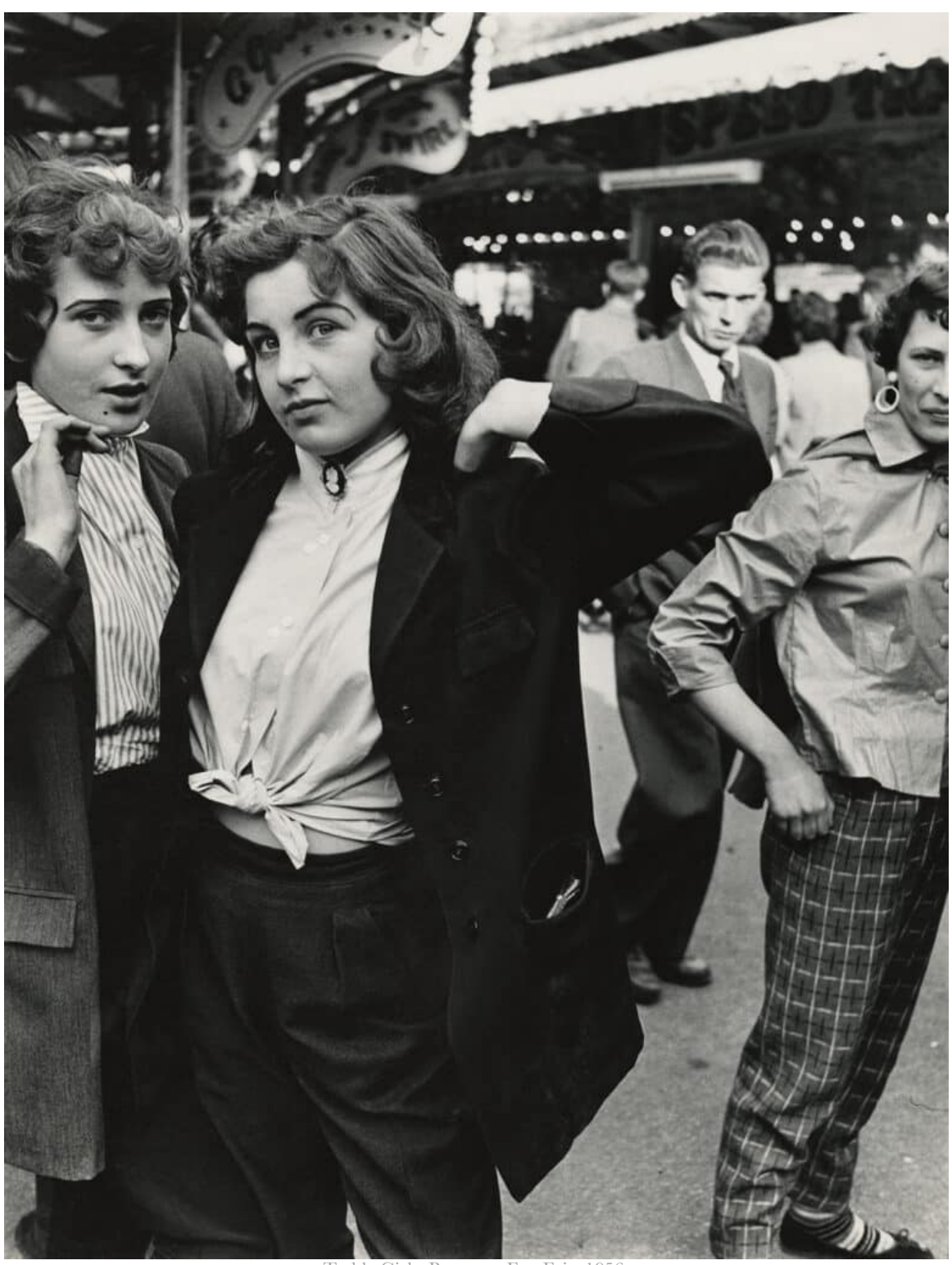
Teddy Girls, Battersea Fun Fair, 1956.