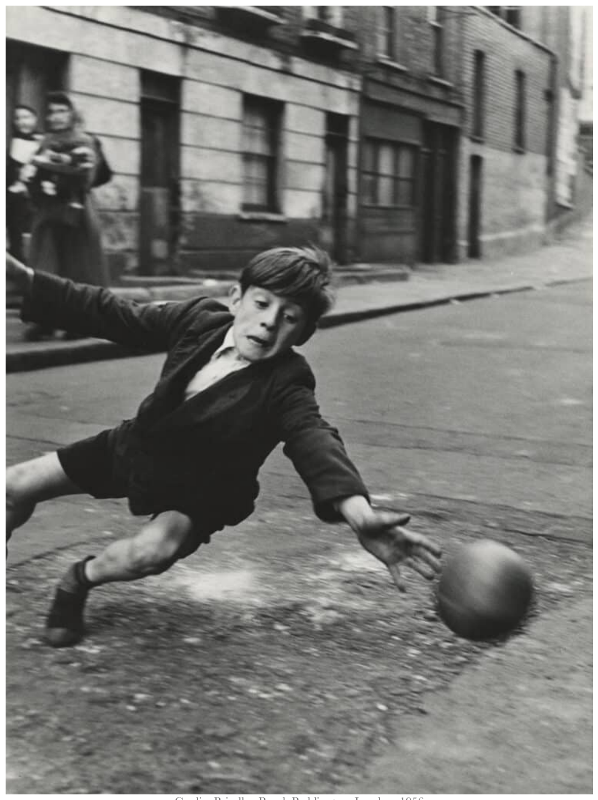
Goalie, Brindley Road, Paddington, London, 1956

The image is part of an exhibition titled What he saved for his family , now showing at The Gitterman Gallery in New York, with the majority of prints in the exhibition