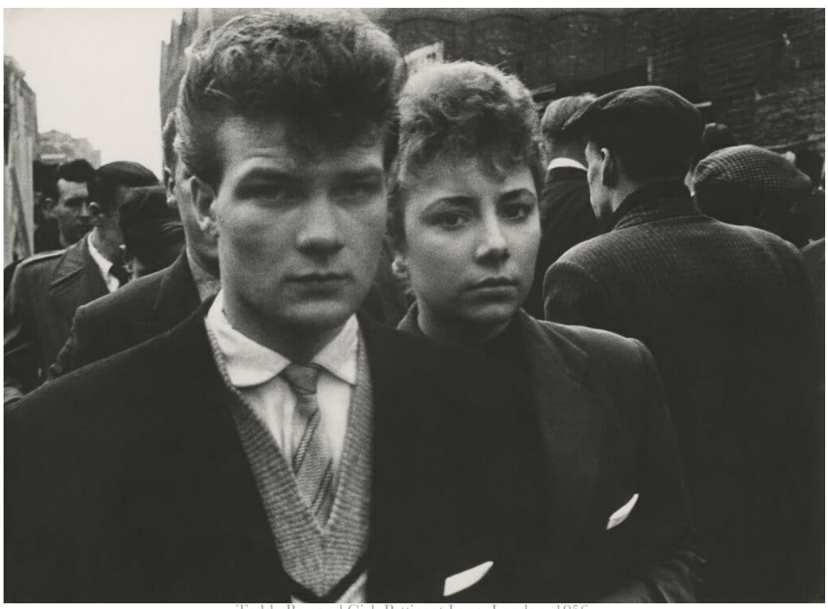
Teddy Boy and Girl, Petticoat Lane, London, 1956.