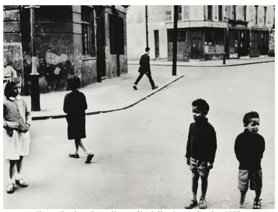
Group, Southam Street Corner, North Kensignton, London, 1957.

Roger Mayne didn't foreground this poverty. He photographed Southam Street in a way that was in some ways nostalgic. He wrote, "Empty, the streets have their own kind of beauty, a kind of decaying always great atmosphere... My reason for photographing the love on them, and the life on them. . . . [I]t may be warm and friendly on a sunny spring weekend when the street is swarming with children playing."